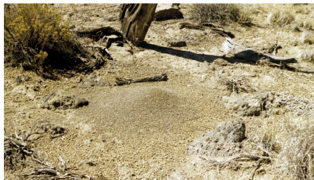
Figure 2. Harvester ant nests typically appear as a low mound in rangeland areas.

They sting, but the ant is so small it generally cannot penetrate the skin of most individuals. The pavement ant primarily is a pest because it nests inside homes and becomes a nuisance in kitchens and bathrooms. Sting hazard by itself does not justify any control action.