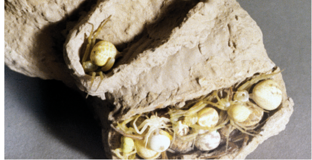
Figure 1b. Mud dauber nest artificially opened shows cells provisioned with paralyzed spiders as food for developing wasp grub.

Spider wasps can sting painfully if handled. But because they are encountered only as individual wasps (rather than as massive colonies in nests), the best way to reduce the sting hazard from spider wasps is to avoid accidental contact and be observant of your surroundings.