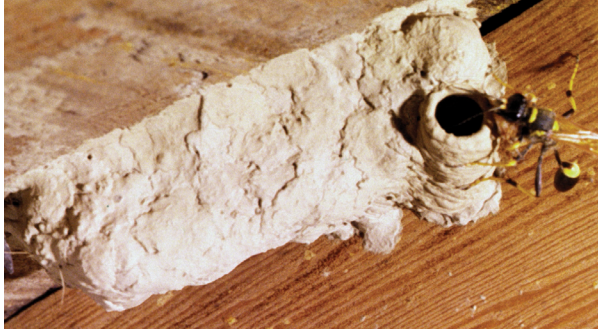
Figure 1a. Nest and adult wasp of blue and yellow mud dauber. Only the immature wasp grubs live inside these nests, not the adult wasps.

Mud daubers are solitary wasps. Each female independently constructs and provisions her own nest. Control action is not warranted for mud dauber wasps. They do not defend their nests and only sting when trapped against the skin or similarly threatened. There is no need to spray nests because adult wasps do not live in them. Mud cells with holes identify empty nests, where larvae have completed development and escaped as adult wasps.