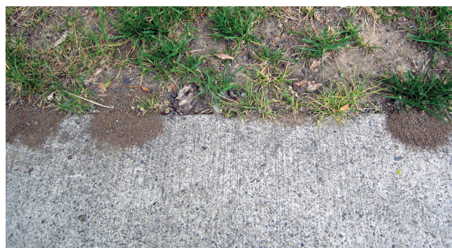
Figure 3. Pavement ant nests along sidewalks and driveways are common to most Idaho home landscapes. The ants pose inconsequential sting hazards.