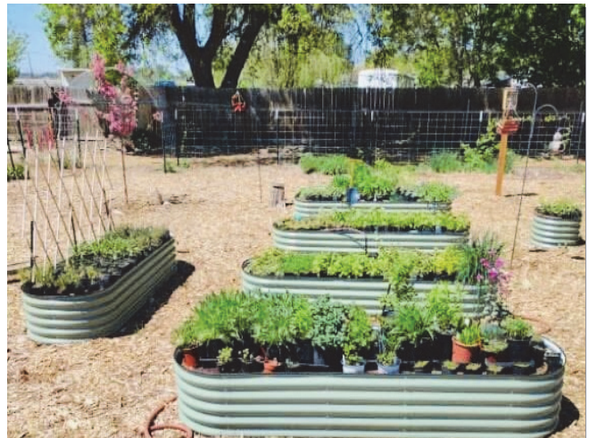
Raised beds at the Canyon Springs Community Garden in Middleton.

The Idaho Master Gardeners created, operated, grew and supervised two important community gardens within Canyon County: Trinity Lutheran Community