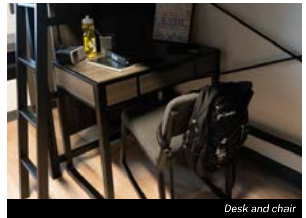
Desk and chair