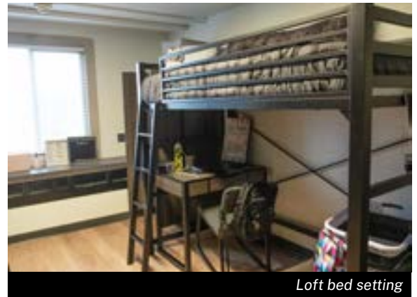
Loft bed setting